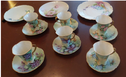
China cups, back in the parlor

Six hand-painted cups from Bavaria have been part of the parlor decorations at the Farmhouse since we completed the parlor décor in 2018. During Christmas decorating in 2019, we packed them away to avoid breakage during the holiday event. But in January 2020, after we put away the Christmas decorations, the cups were nowhere to be found. We were afraid that they had accidentally been thrown away with the recycling. In 2020, we didn't decorate due to the pandemic.