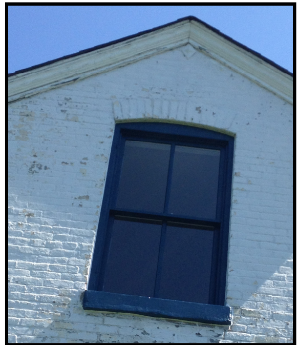
South upstairs window